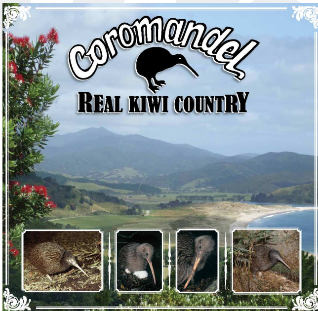
Look out for MEG's new kiwi info board at James reserve Coro Town.

Sadly MEG recently lost the use of the building at Waikawau Bay that has been our home base for the last few years so a lot of work was needed to relocate the workshop and find accommodation for volunteers. On a positive note we received an award for 10 years of valuable contributions to the environment at the Hamilton Enviro Centre's Christmas function. And for the second year in a row MEG are finalists for the Loader Cup, NZ's premier conservation award. This is a direct reflection of the hard work of many volunteers and MEG members and the wonderful support land owners and the public give MEG year in year out. We look forward to your support in the coming years as we continue the task of leaving Coromandel's natural environment in a better state for the next generation of kiwi & kiwis.