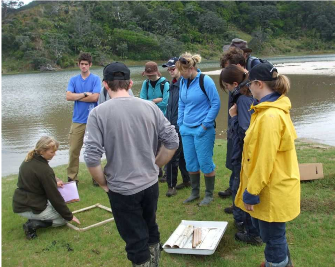
Global volunteers learn vegetation monitoring at Waikawau Bay

I read in a recent 'Time' magazine that Mark Twain arrived at the not unreasonable but never popular conclusion that "mankind was not made for any useful purpose, for the reason that he hasn't served any; that he was most likely not even made intentionally; and that his working his way up out of the oyster bed to his present position was probably a matter of surprise and regret to the Creator". There are a million instances to back this claim in my opinion, but some relevant to our own little corner of the world come to mind.