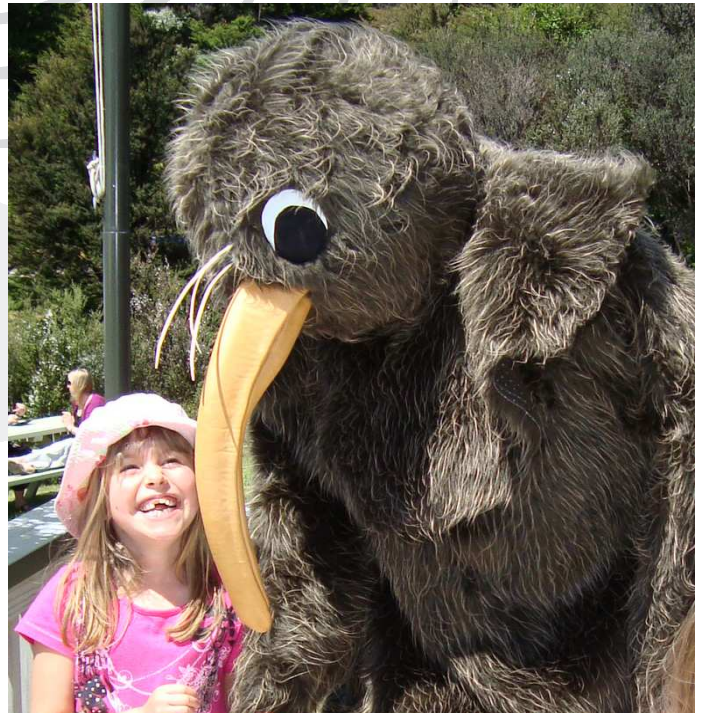
Koro the Kiwi – All smiles at the Paua Festival, Tangiaro Kiwi Retreat, Port Charles on Labour Weekend.

The big news for the new 1000ha Coromandel Area School (CAS) Kiwi Project is that the trap lines are in and the World Wild Life Fund (WWF) have awarded a $1,500 grant to the project.