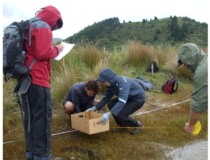
Global volunteers measure the march of saltwater Paspalum .